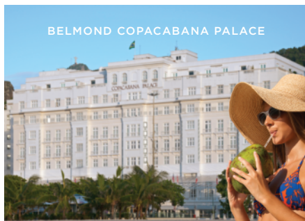
BELMOND COPACABANA PALACE