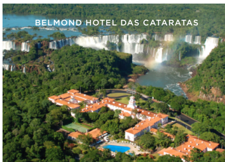
BELMOND HOTEL DAS CATARATAS

Discover the reasons why Rio de Janeiro is known as the wonderful city and delight yourself at the iconic Belmond Copacabana Palace, with a view of the famous Copacabana Beach.